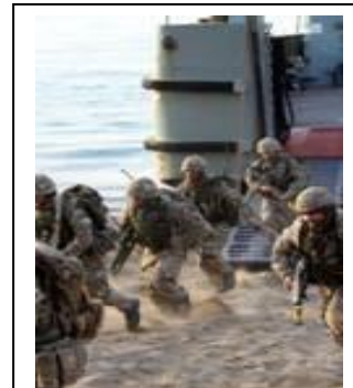
7 SCOTS disembark from a LC during Ex LION STAR 3.